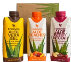
MINI TRIPACK 330ML MIX

Good things really do come in small packages, especially when it comes to the incredible benefits of Forever Aloe Vera Gel - now available in 330 ml container. All the goodness of our pure inner leaf aloe vera gel ready for you to enjoy at home or on the go.